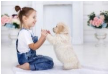
She has a pet.

3. Write according the pictures and follow the example about, who has a pet and who has no pets. (Escreva de acordo com as fotos e siga os exemplos sobre, quem tem um animal de estimação e quem não tem.)