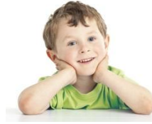
He has no pet.